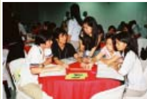
Participants puzzle over molecular phylogeny