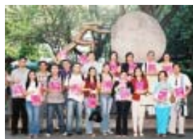
Winners of Unilever Giftpacks.