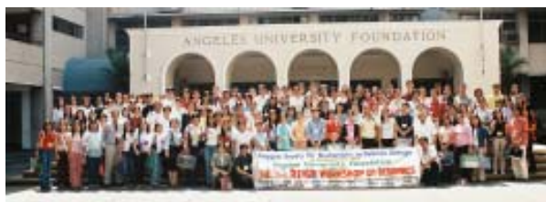
Participants of the 3rd Revup Workshop