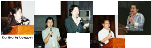
The RevUp Lecturers