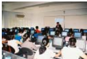
Participants are guided through the virtual lab and computer exercises.